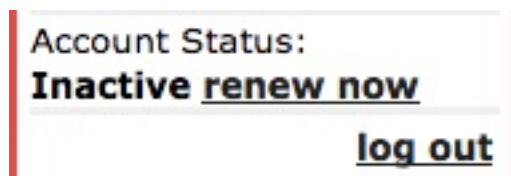
Figure 4. Log in to account at start of season is Inactive

At the start of each season, the first time that you log in to your SkiRaceReg.com account account status will be displayed as "Inactive" (Figure 4) and a Renew Membership page will be displayed.