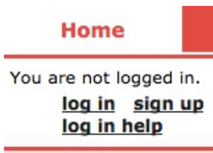
Figure 3. User Account panel – log in or sign up

At top left of every page is a panel that let you to log in or sign up to open a new account (Figure 3).