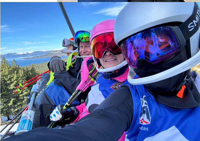
A beautiful view of Lake Tahoe from the chairlift.