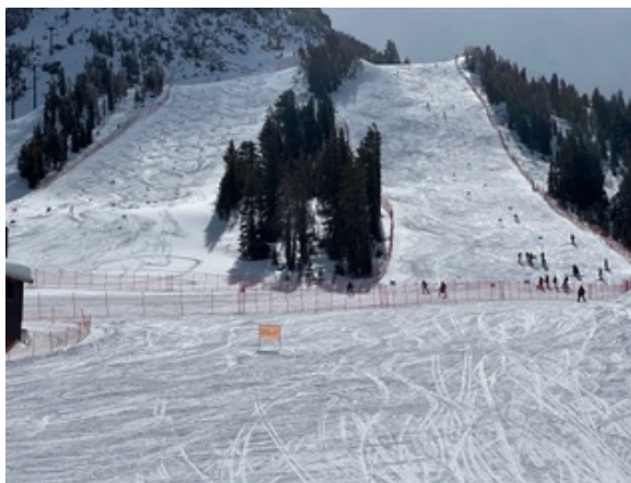
The January 21 Mammoth course