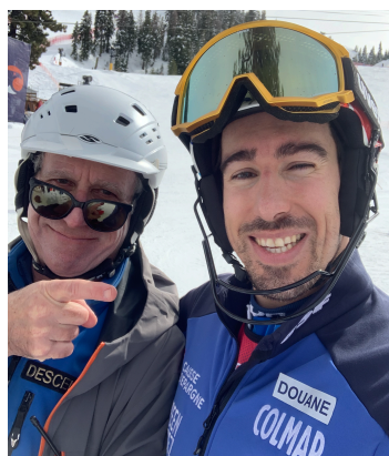
Rees and French World Cup racer Victor Muffat-Jeandet