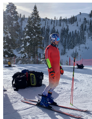
Some Swiss guy admiring the beautiful Palisades