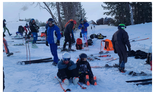
In the start area of the January 21 Mammoth race

To donate to the Far West Masters Scholarship program, go to: farwestmasters.org/scholarship_program