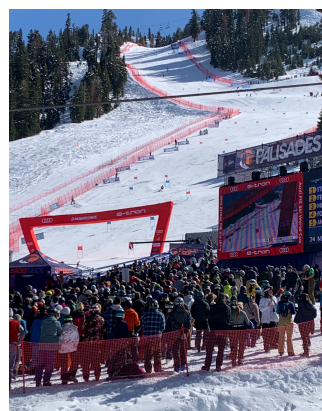
Tough hill, great crowd