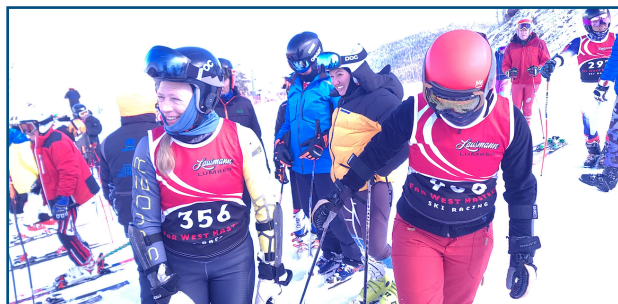
In the start area of the January 21 Mammoth race

Our first End of Season Banquet since 2019 will happen after the Palisades GS on Saturday, April 6. We will have speeches from Scholarship recipients, a silent auction, and dinner. Look for more details about this event, a list of silent auction items, and how to bid on the silent auction in the next newsletter. (Note: Parking reservations currently not required for the April 5-6 races at Palisades.)