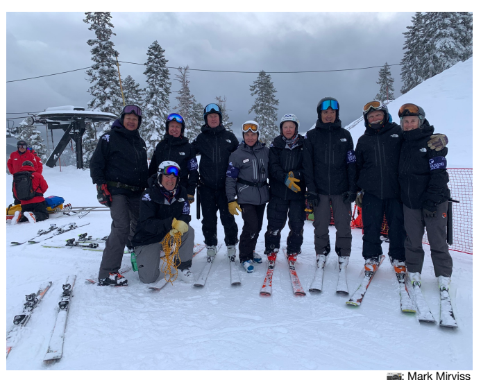
Far West Masters coaches working at the 2023 Palisades Tahoe Cup.

Thank you for your time and interest in volunteering!