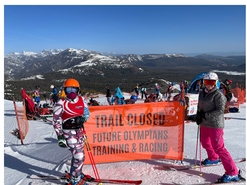
Far West Masters racer wish fulfillment Season Finals at Mammoth Mountain in April, 2022