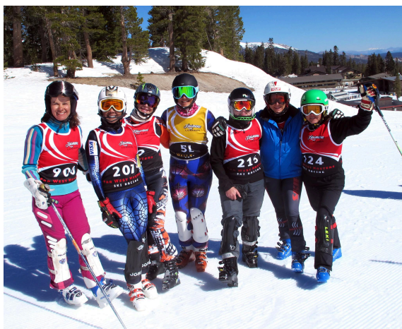
Post race celebrations.

http://farwestmasters.org/raceinfo/current/standings http://farwestmasters.org/reports/results/2016/FWM2016-SeasonAwards.pdf