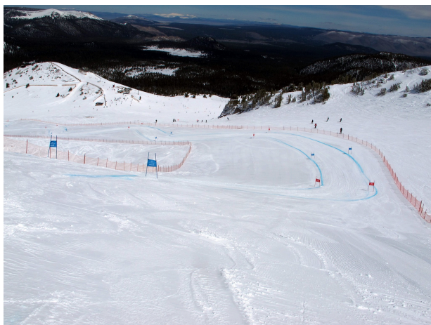
Looking down on the SG course.