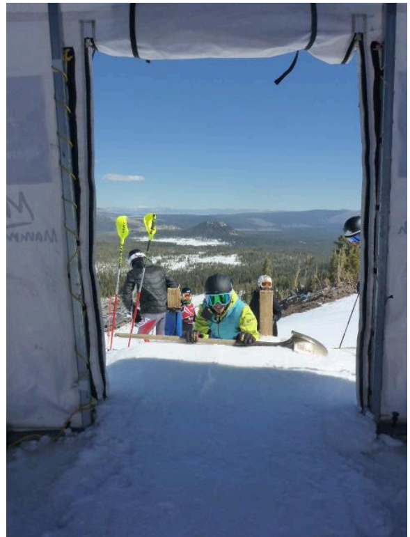
Emily Andrews inspecting the start.