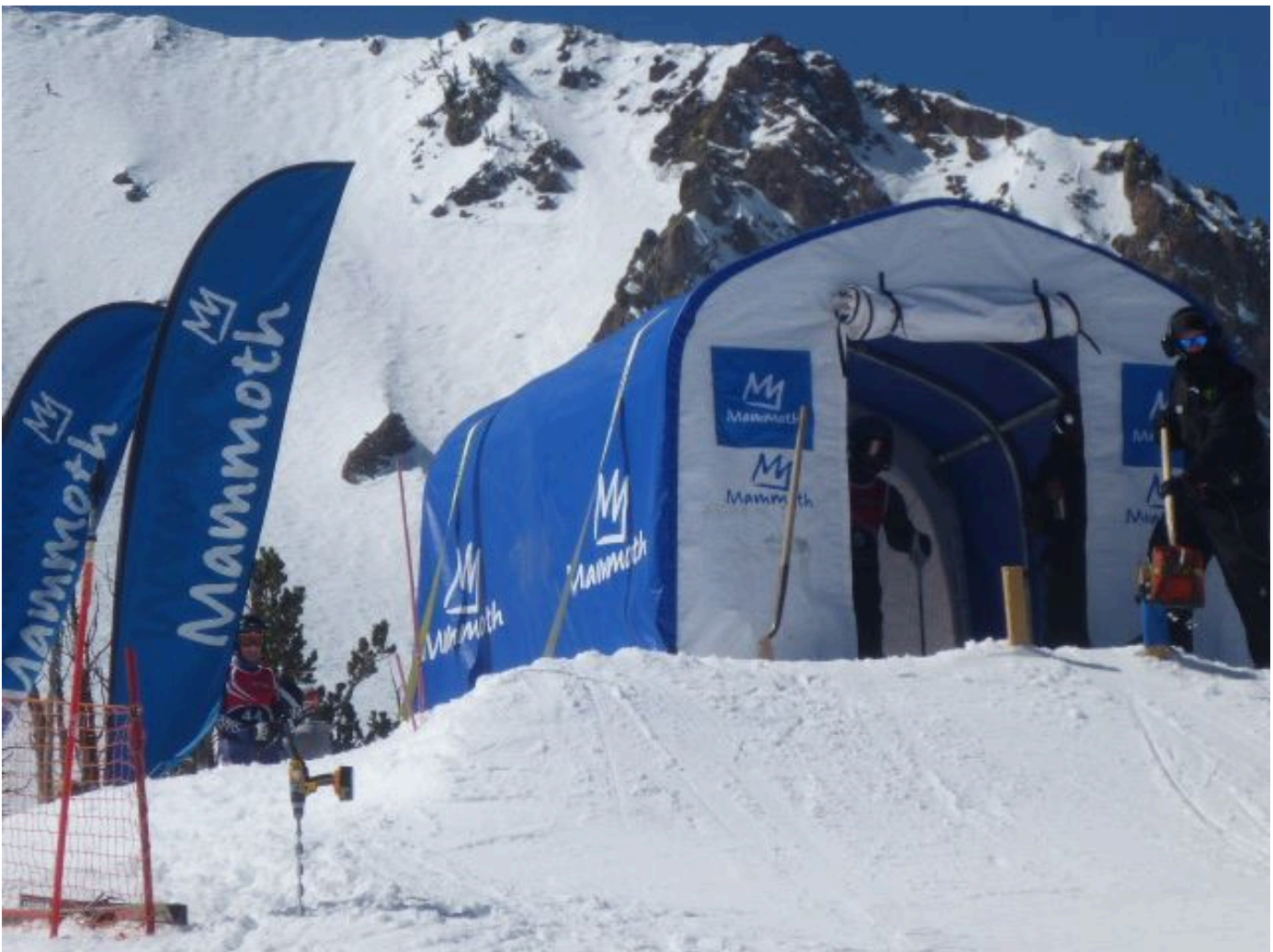
The Start Haus for the Mammoth Season Finals