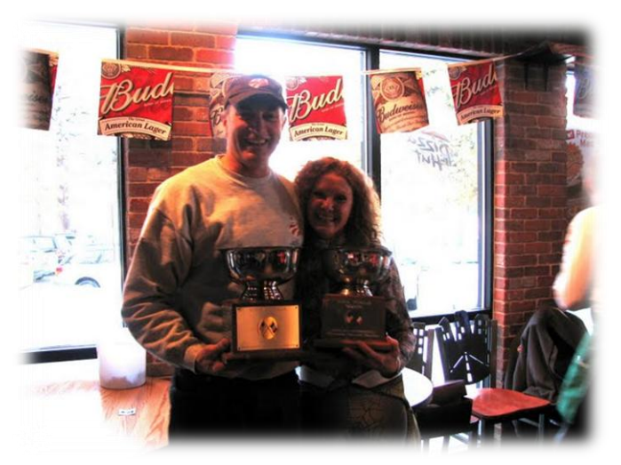
BERNARD CUP WINNERS