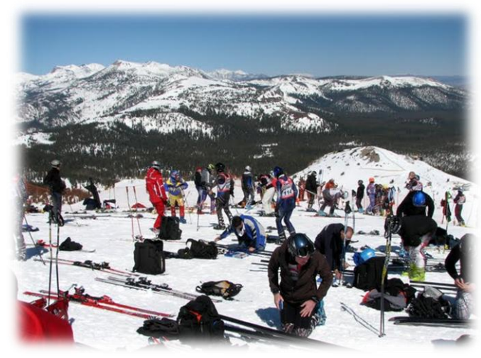
SUPERG SKI PREP AT MAMMOTH