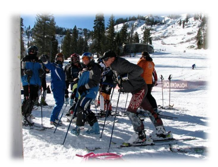
CHECKING RESULTS AT ALPINE