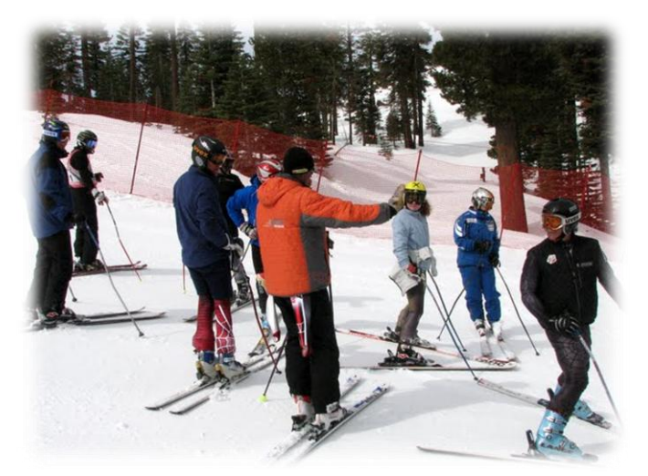
COURSE INSPECTION AT NORTHSTAR