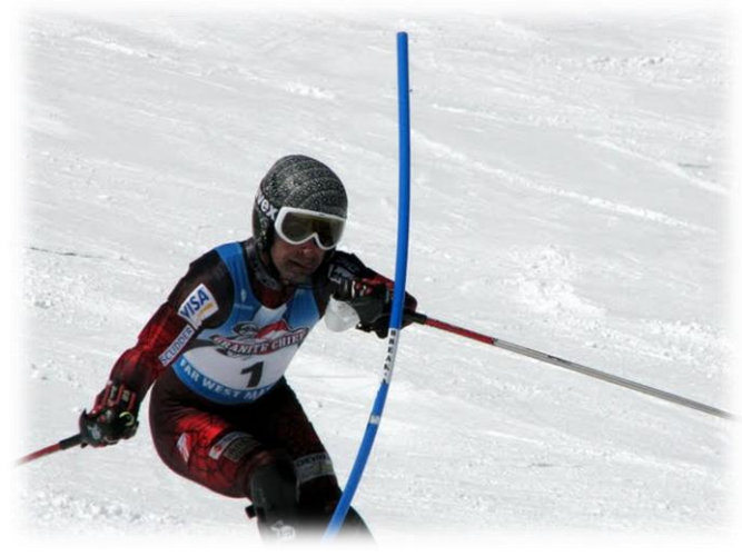
ARA AT MT. ROSE SLALOM